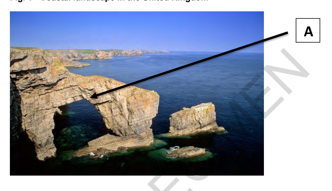
Fig. 1 - Coastal landscape in the United Kingdom